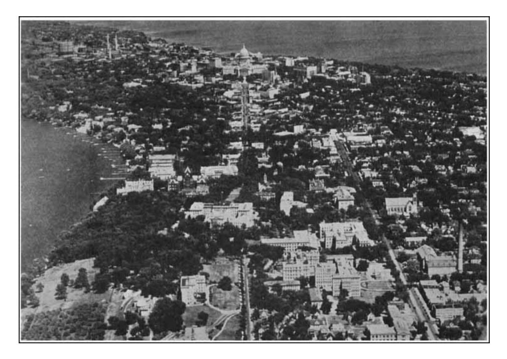
The State Capitol and Lake Monona in the background, Lake Mendota to the left with fraternity house piers extending into the Lake and some of the University buildings in the foreground.